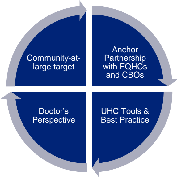
Central Regional Town Hall Meeting